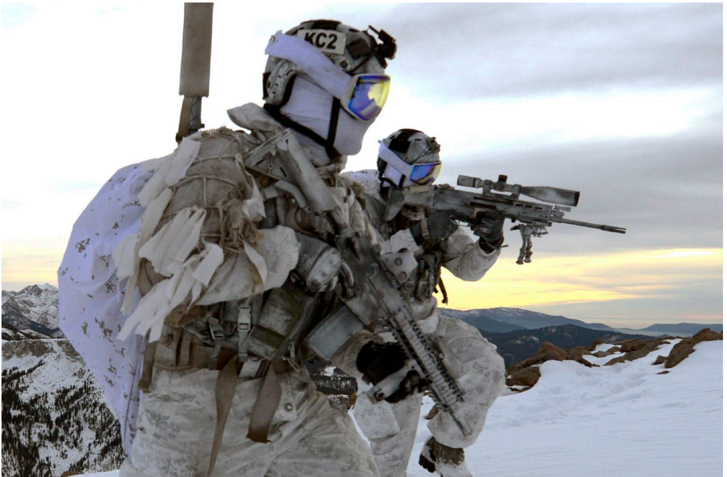
Navy SEALs being trained in Arctic Warfare.

military equipment for use in Arctic warfare. The traditional May Day parade in 2017 saw Arctic versions of the Tor-M2DT and Pantsir-SA SAM systems displayed on new amphibious tracked chassis. Meanwhile, the Oscar II class submarine, the Belgorod is being converted from a cruise missile sub to a research and special operations vessel designed to operate in the Arctic. With provision for midget submarines and divers, speculation