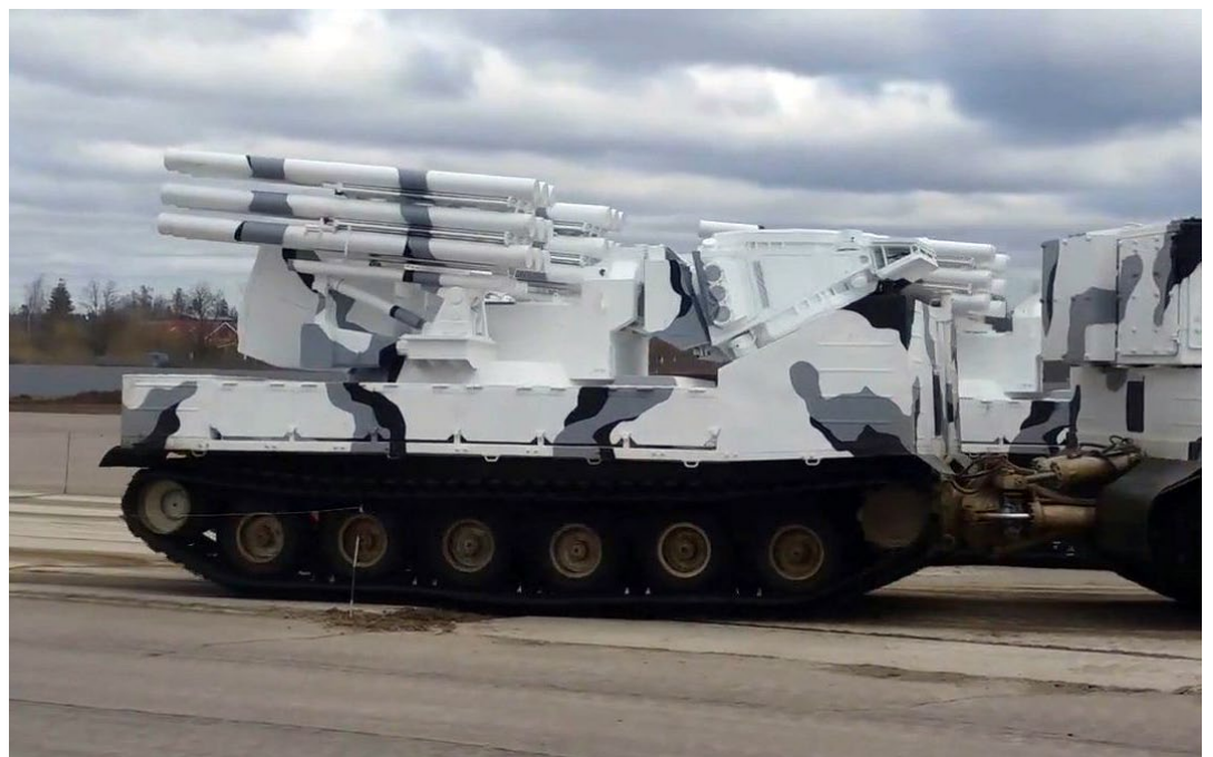
Russian TOR-M2DT Arctic short-range air defense missile system.

Third, is that shrinkage of Arctic pack ice due to climate change, now means that previously hard-to-reach areas are becoming uncovered, making resource extraction easier and less expensive. The shrinkage of