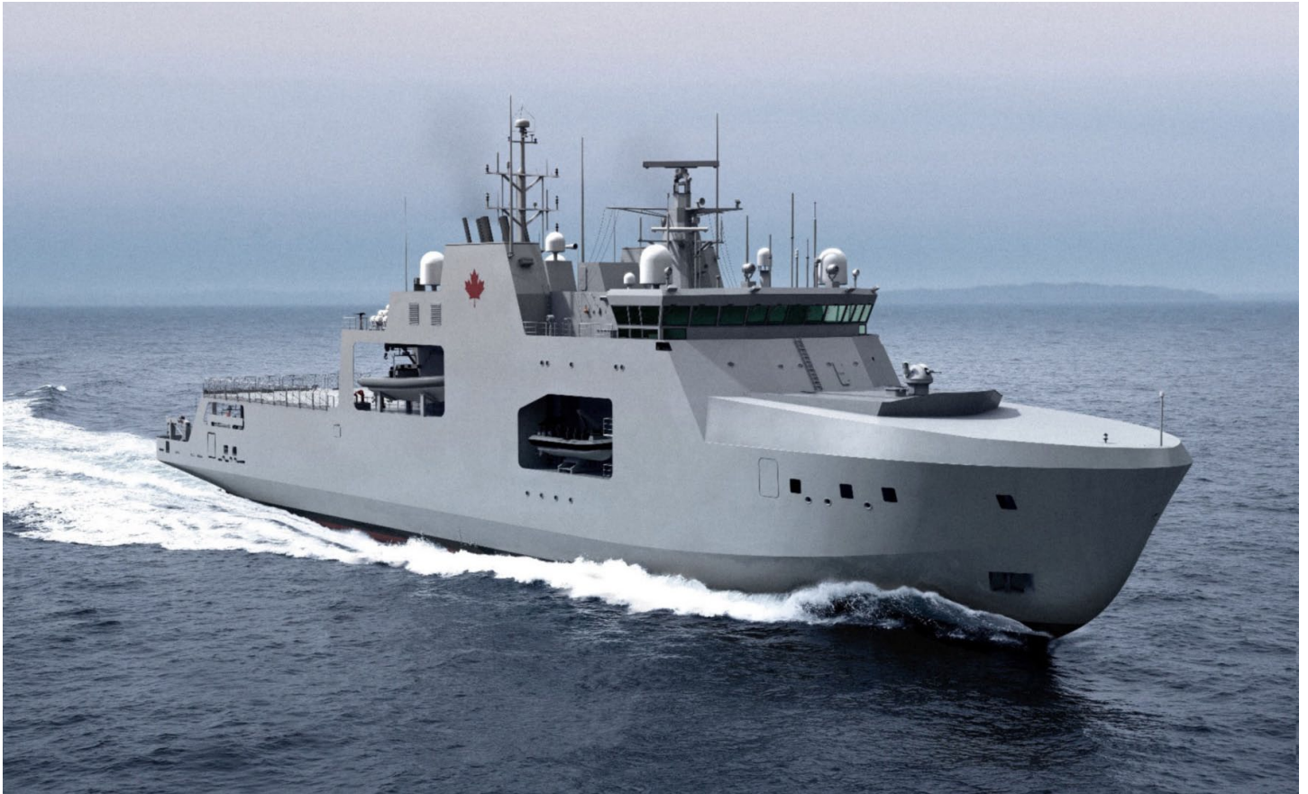
Canadian new Harry DeWolf -class offshore patrol vessel.

is that the Belgorod may be involved in setting up a 'Russian SOSUS', or a chain of sea-bottom hydrophones in the Arctic. In addition, a new class of Russian icebreakers is set to be armed with containerised cruise missiles.