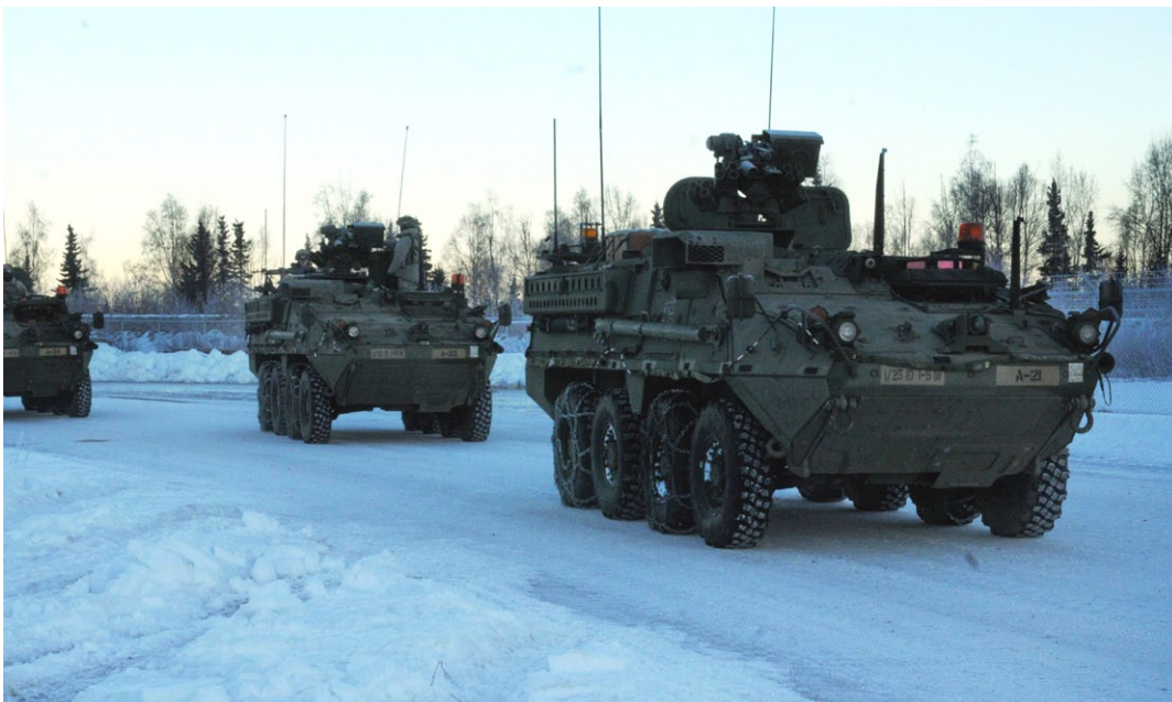
US Stryker armoured vehicles have been deployed for the first time in Alaska.

Some 30 years before the start of 'the War to End All Wars' in 1914 a race among the great powers to conquer, occupy and divide the spoils of a continent saw the 'Scramble for Africa' take place. Could a new scramble for riches unravel in the same way? Certainly the vast wealth, new shipping routes, along with the strained East-West relations means that it has the potential for wider geostrategic implications even for countries without an Arctic coastline. One caveat, of course, is the stubbornly low price of oil – even with conflict raging across the Middle East. This, and the US's shift to fracking to reduce its reliance on foreign energy reserves perhaps means that one point of key friction has been removed. Yet the Arctic, plausibly, provides the potential, if not for a full-on ground war, then limited skirmishes, naval or air clashes, or the kind of high-stakes espionage that characterised the Cold War.